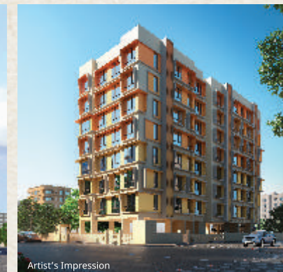
TEJAL BHUVAN CHS LTD, VILEPARLE (E)