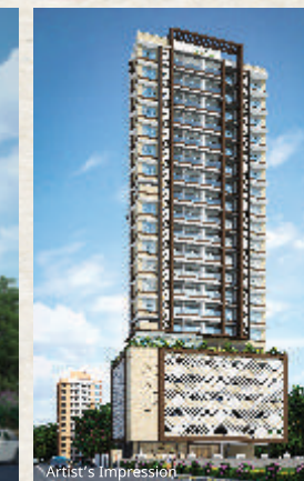
REGENT AURUM, GIRGAON MahaRera Regn. No: P51900047404