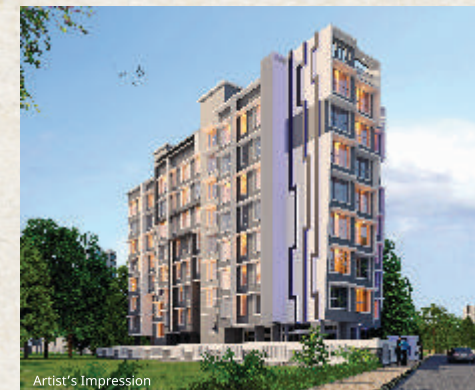
DEEPA CHS LTD, VILEPARLE (E)