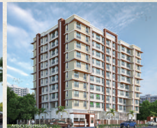
JEEVANTARA CHS LTD, VILEPARLE (E) MahaRera Regn. No: P51800049161