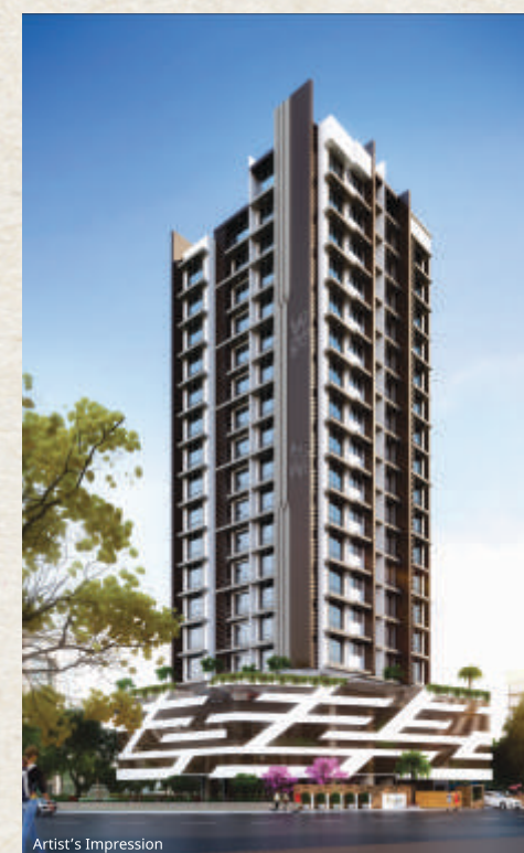
REGENT GALAXY, MALAD (W)