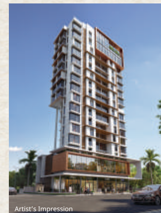
ADVENT NEEL, JUHU MahaRera Regn. No: P51800032332