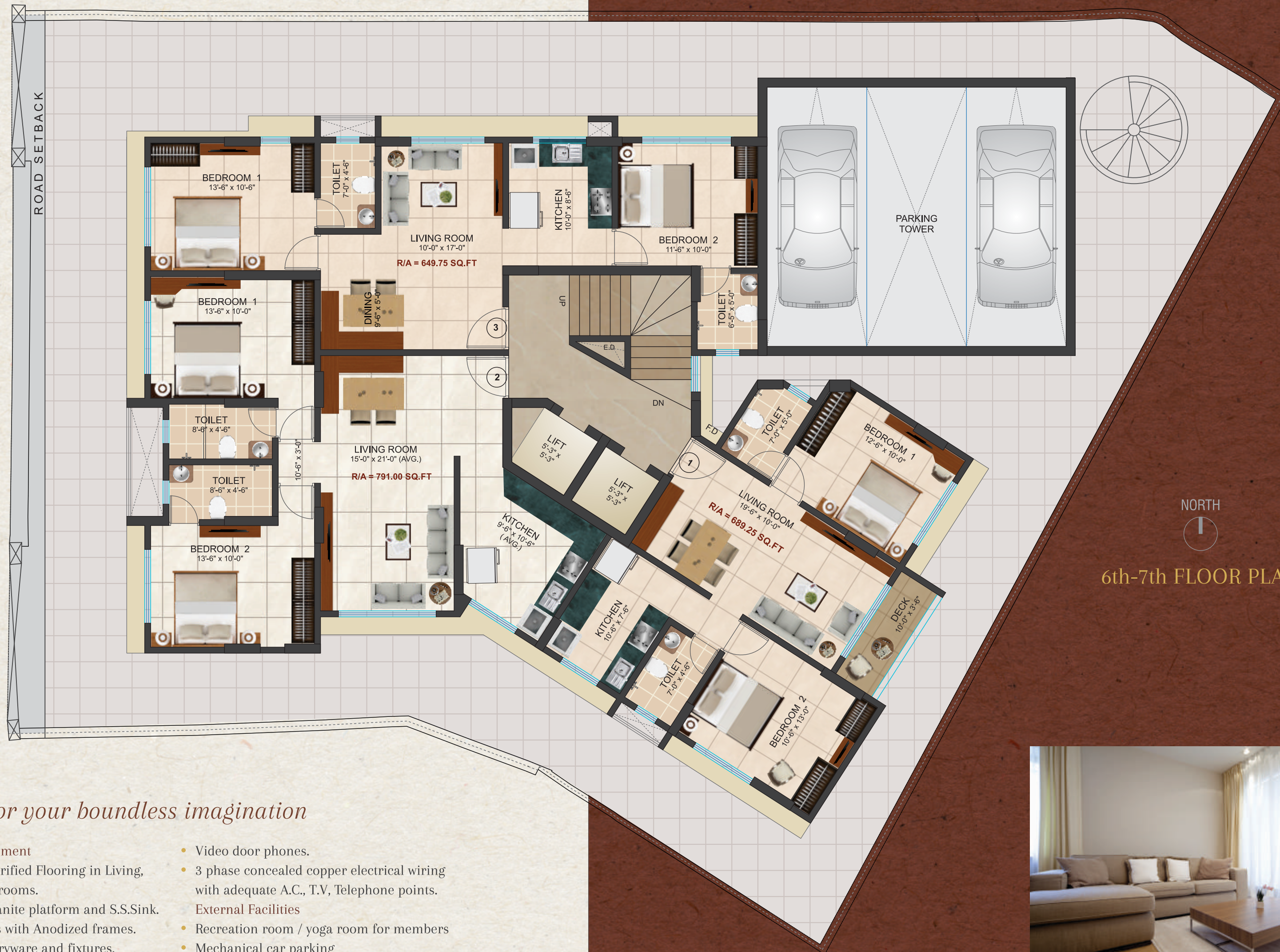
6th-7th FLOOR PLAN