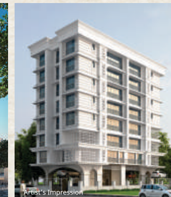
AANGAN, VILEPARLE (E)