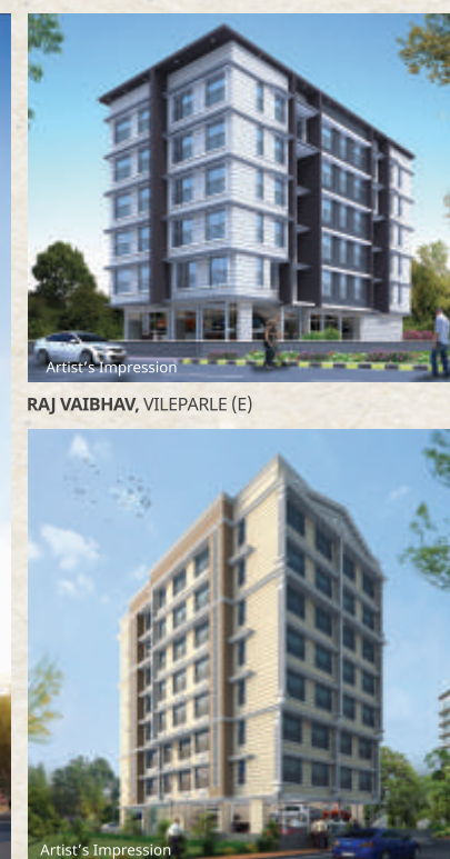
SAKET, VILEPARLE (E)