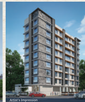
OM MADHUSADAN CHS LTD, VILEPARLE (E) MahaRera Regn. No: P51800034194