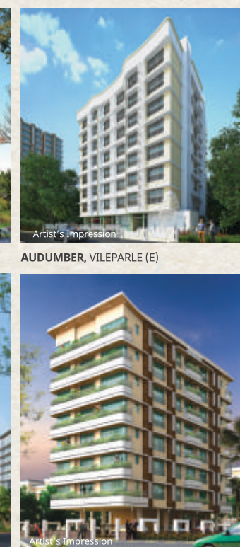
RADHA RESIDENCY, JOGESHWARI (E)

The Regent Group began its illustrious journey in 2007 with the resolve to deliver only the best in realty projects and the vision to consistently introduce to communities, a higher lifestyle standard. They work with a passion for perfection and do well to exceed and go beyond expectations. The dynamism of the Regent group and its associate groups has won them accolades for their array of completed projects that span Residential Complexes, luxury homes as well as Commercial projects in Vile Parle, Andheri, Goregaon and Girgaon.