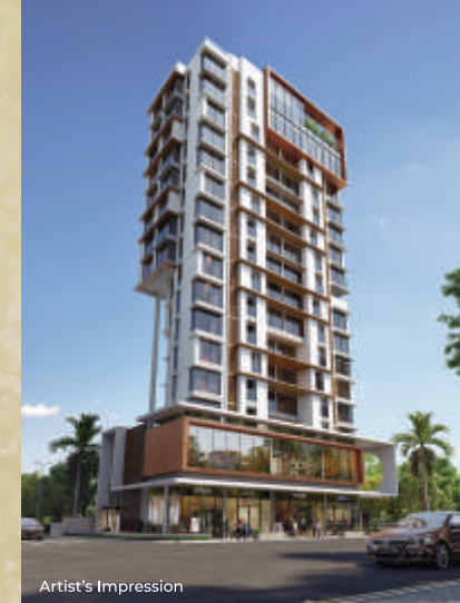
ADVENT NEEL, JUHU MahaRera Regn. No: P51800032332