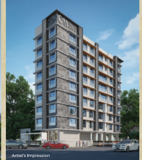
OM MADHUSADAN CHS LTD, VILEPARLE (E) MahaRera Regn. No: P51800034194