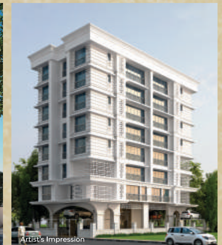
AANGAN, VILEPARLE (E)