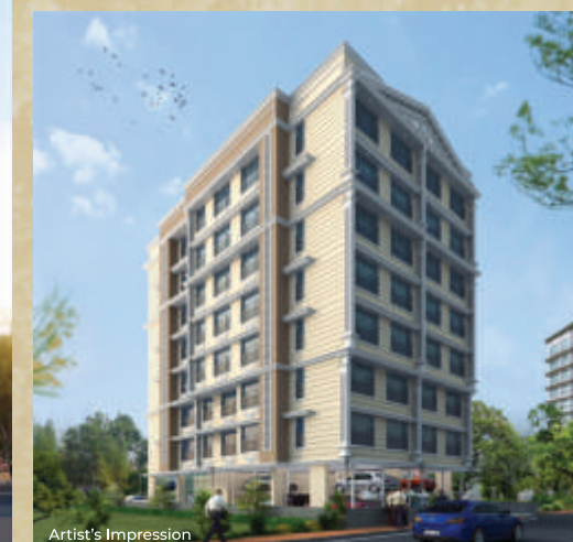
SAKET, VILEPARLE (E)