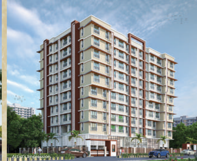
JEEVANTARA CHS LTD, VILEPARLE (E) Full IOD issued