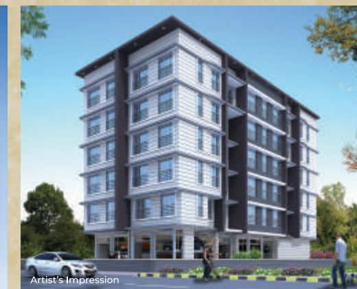
RAJ VAIBHAV, VILEPARLE (E)