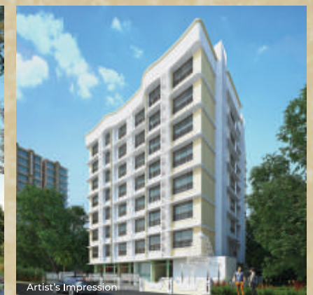
AUDUMBER, VILEPARLE (E)