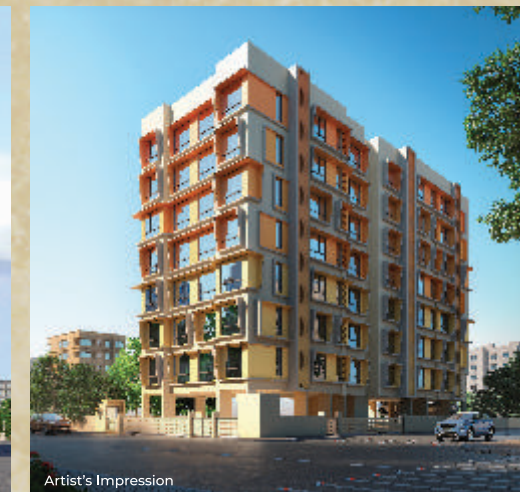
TEJAL BHUVAN CHS LTD, VILEPARLE (E)