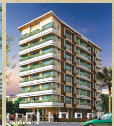
RADHA RESIDENCY, JOGESHWARI (E)