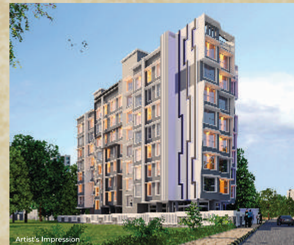
DEEPA CHS LTD, VILEPARLE (E)