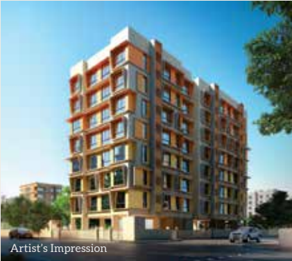
TEJAL BHUVAN CHSL , VILEPARLE (E)