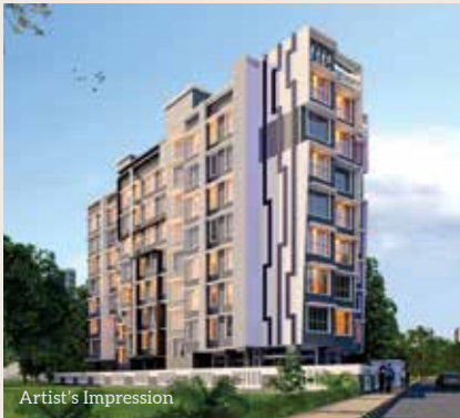
DEEPA CHSL , VILEPARLE (E)