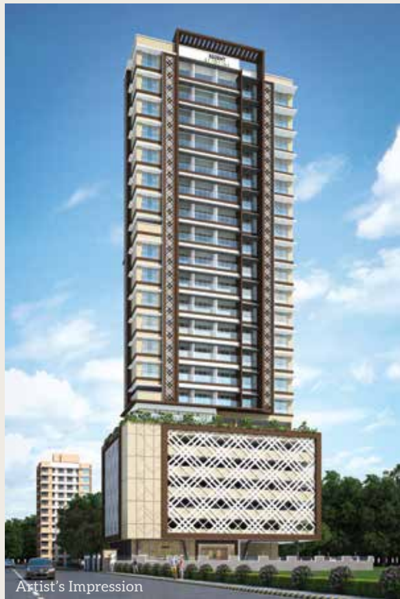
REGENT AURUM , GIRGAON MAHARERA REGN. NO: P51900047404