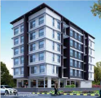
RAJ VAIBHAV , VILEPARLE (E)