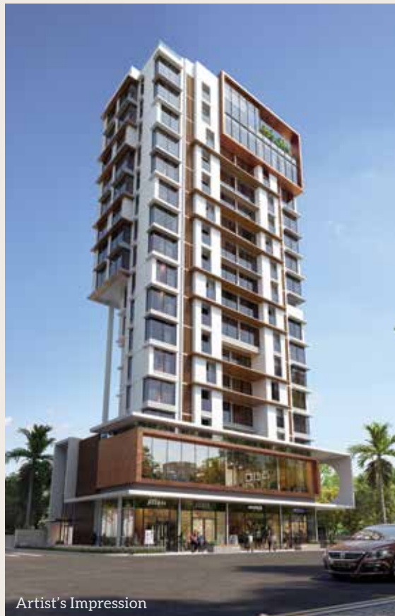
ADVENT NEEL , JUHU MAHARERA REGN. NO: P51800032332