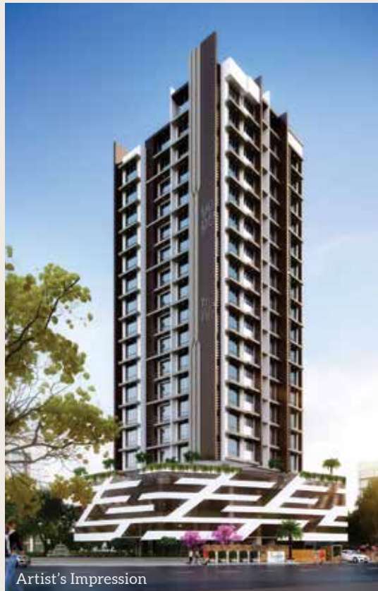
REGENT GALAXY , MALAD (W)