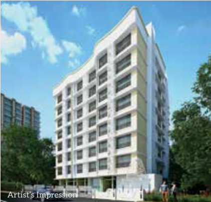
AUDUMBER , VILEPARLE (E)