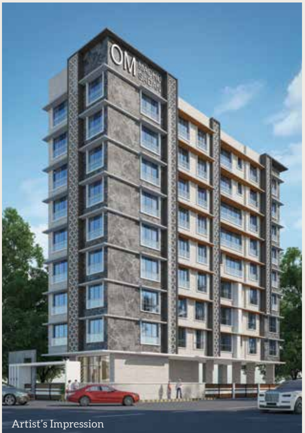
OM MADHUSADAN CHS LTD , VILEPARLE (E) MAHARERA REGN. NO: P51800034194