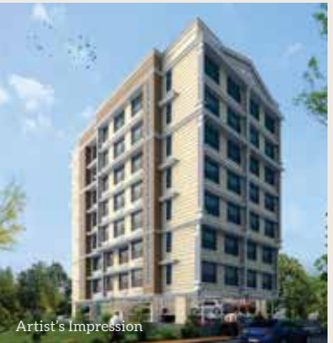
SAKET , VILEPARLE (E)