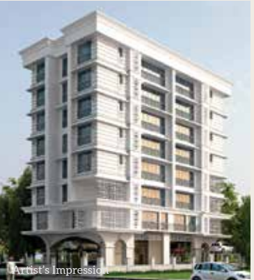
AANGAN , VILEPARLE (E)